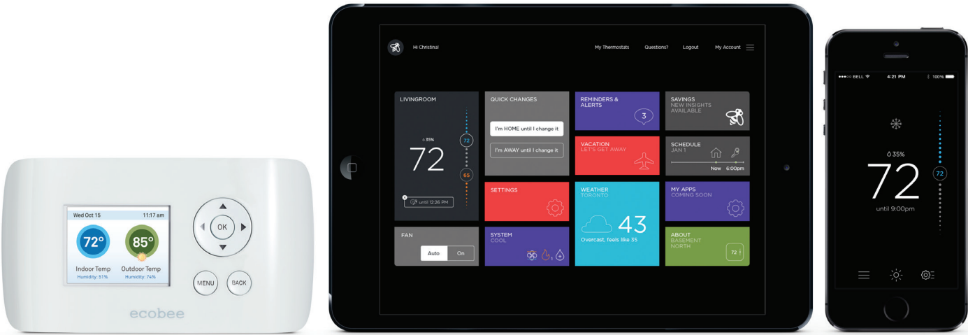
ecobee portal and mobile app